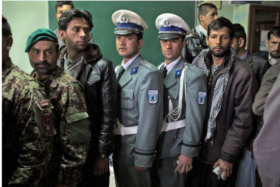
Afghans voting despite Taliban threats, April 2014.

DRAFT syllabus April 2014 – subject to changes